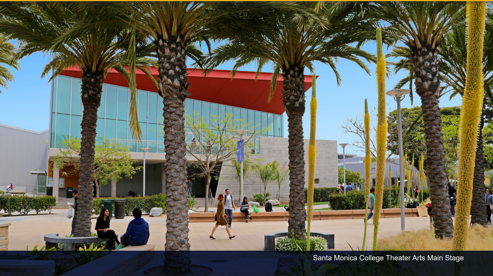
Santa Monica College Theater Arts Main Stage