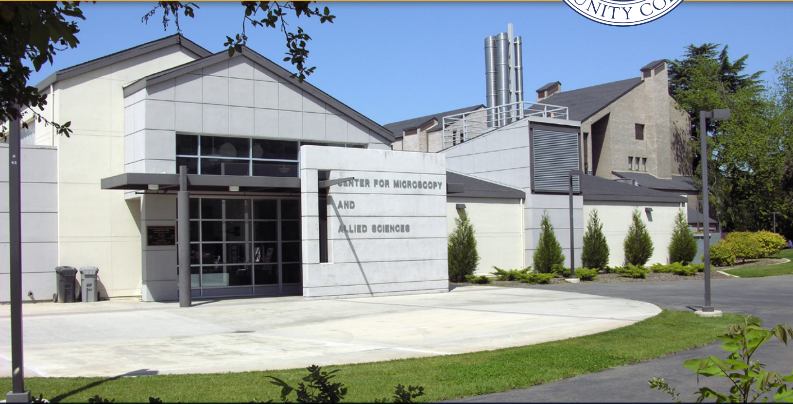
San Joaquin Delta College Center for Microscopy and Allied Sciences