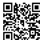
OneSearch (Library Catalog)