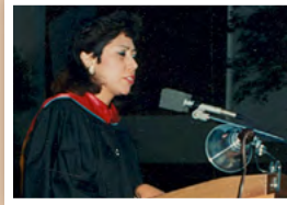
Hon. Hilda Solis as Rio Hondo Community College District Trustee in 1989 speaking at Commencement.

Rio in the News! Read more about commencement in the Los Angeles Wave.