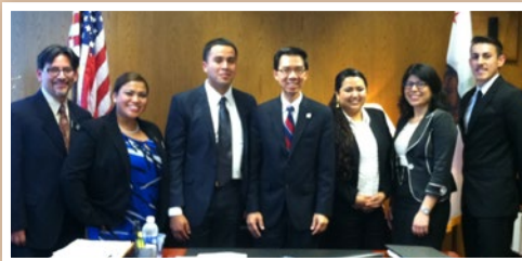
Rio Hondo College students and staff meet with Assemblymember Ed Chau.

Three Rio Hondo College students took the State Capitol by storm on March 3 as they joined thousands of their peers statewide to lobby legislators in Sacramento at the annual "March in March" event.