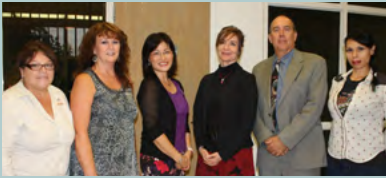
Members of the 2013 Leadership Academy were introduced to the Board of Trustees at the Sept. 11 meeting.

The Rio Hondo College Board of Trustees adopted a balanced budget on Sept. 11 that keeps the College fiscally solvent and maintains top-notch services and resources for its students.