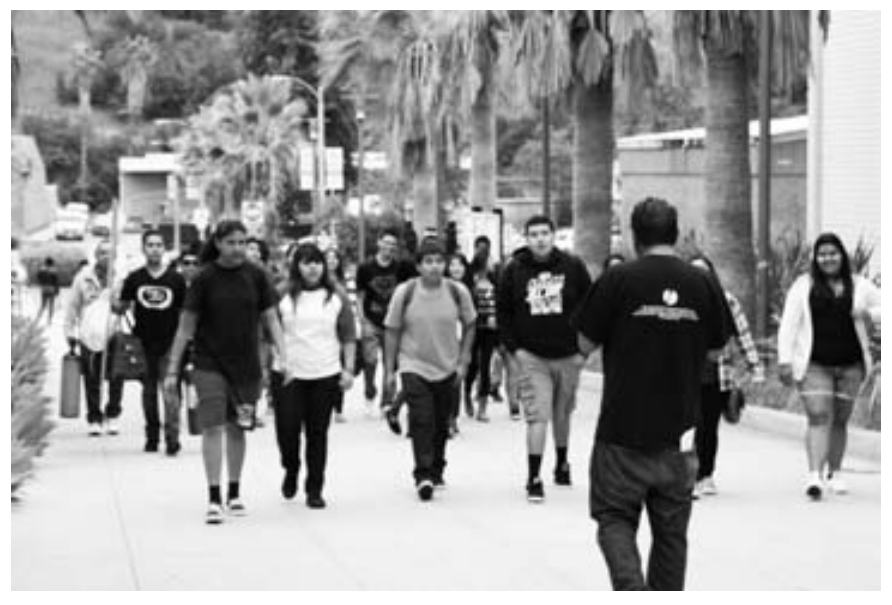
Rio Hondo College / 11

Each computer user is responsible for the use of computing resources in an effective, efficient, and lawful manner. Computing resources and equipment are college property, and the college