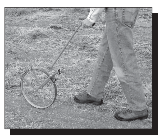
Figure 1—A measuring wheel can be used to measure the distance of the test course.

Participants must be informed of the course layout (use a map or sketch of the course). Use distance markers (at 1 or 1.5 miles) to help candidates pace themselves. Use hazard and traffic markers as needed.