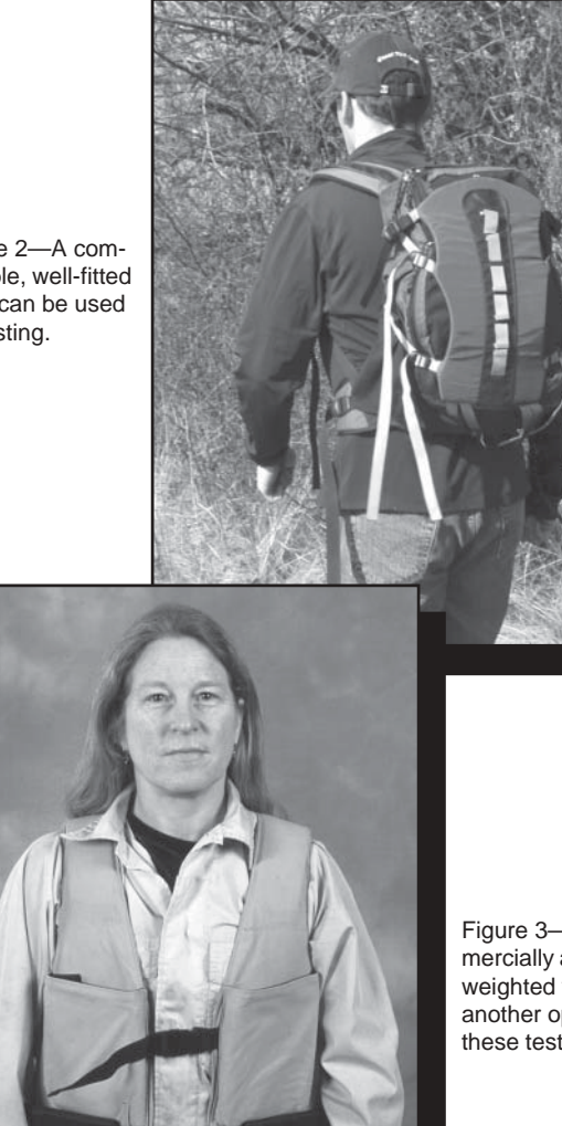
Figure 2-A comfortable, well-fitted pack can be used for testing.

Figure 3—A commercially available weighted vest is another option for these tests.